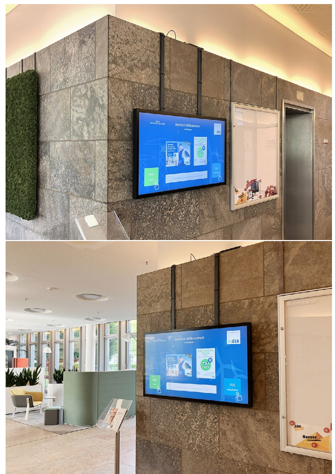
Figure 5: Terminals in the entrance area

In addition, various location managers can be created in the SiteKiosk online administration area. This enables the assignment of special user rights and determines that defined certificates, content and data are only available to selected users at the respective locations.