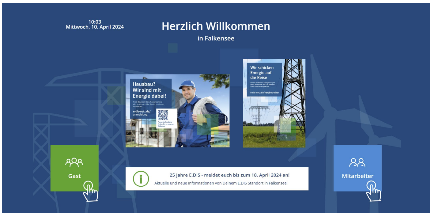
Figure 1: Home page employee terminal – Herzlich Willkommen in Falkensee

With SiteKiosk Online, secure and comprehensive employee terminals can be realised that have a positive influence on the internal communication process in companies.