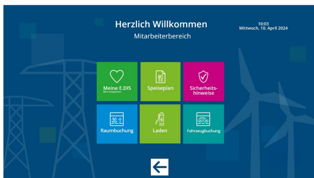
Figure 3: Employee area with sensitive content

Defined variations allow different content to be displayed depending on the location. Each terminal at the eight different locations displays different content. The terminal at the Falkensee location, for example, displays a text field with the content 'Welcome to Falkensee' and contains location-related data and information in the 'Safety instructions' (german: Sicherheitshinweise) and 'Menu' (german: Speiseplan) areas. The terminal in Potsdam displays the text 'Welcome to Potsdam' and the specific location information. Variations can be set and determined with little effort within SiteKiosk Online.