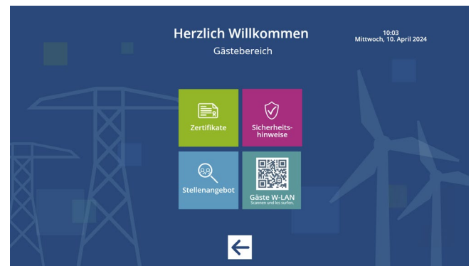
Figure 2: Guest area with public information

The guest area (see Fig. 2) is freely accessible. Clicking on the green button labelled 'Guest' takes you to the guest area. General certificates and safety instructions are available here. Visitors can find out about correct behaviour in the company. Job advertisements and access to the guest WiFi are also provided.